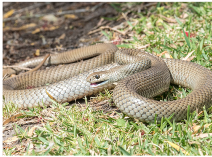
Eastern brown snake ( Pseudonaja textilis )