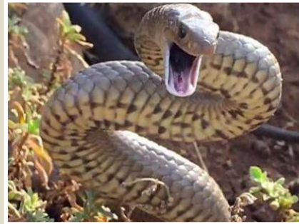
Mainland tiger snake ( Notechis scutatus )