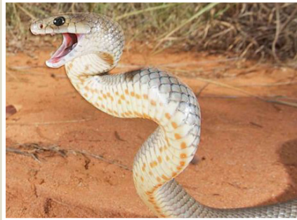
Western brown snake ( Pseudonaja mengdeni )